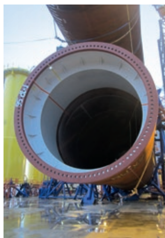
Monopile on deck