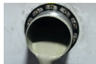
Bolted connection and grout overflow