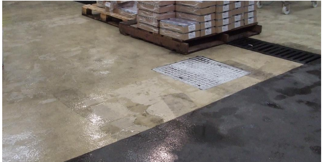
Our reference in Kumasi (Ghana): Diageo PLC