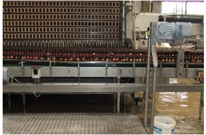
Our reference in Kumasi (Ghana): Diageo PLC