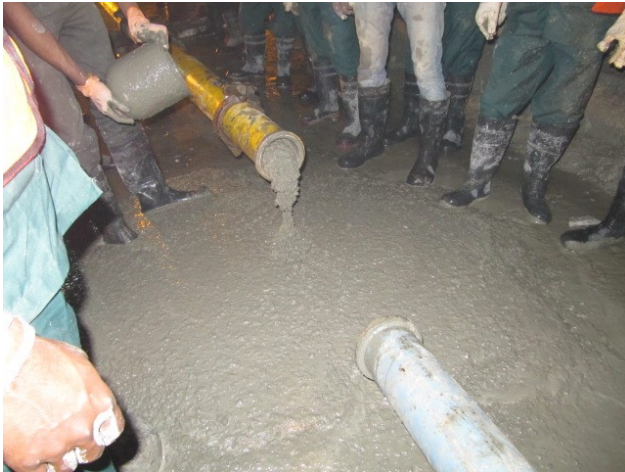
Flow of concrete at 2,400m from the pumping point

World record for long distance concrete pumping to 2.432 Km