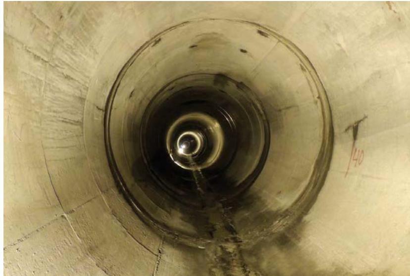
Head Race tunnel of 100 MW Sainj Hydroelectric Power Plant