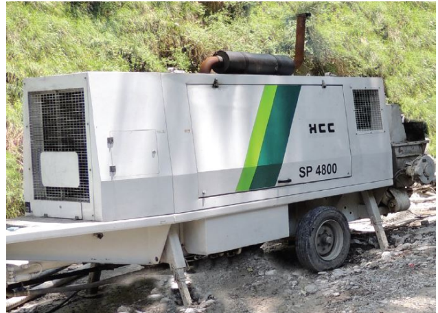
Concrete pump is the heart of the operation. It can be operated on 2 sides-piston side ( for Long distance ) and rod side ( for short distance )