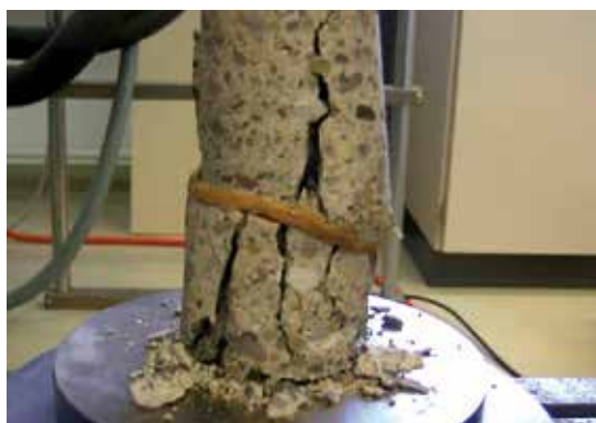
Composite shell lining: crack bridging