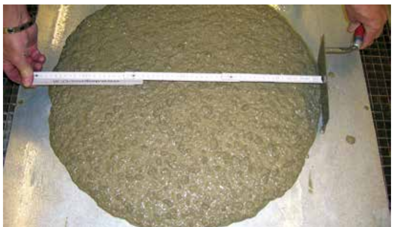
Sprayed concrete quality testing

As a consequence of the growing use of sprayed concrete as a permanent construction material for tunnel linings, demands on its durability have increased likewise. It offers more flexibility in terms of the geometry and space requirements. Permanent sprayed concrete is a requirement for the innovative composite shell lining design (see page 8).