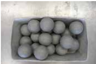
Figure 2. Steel balls used for impact