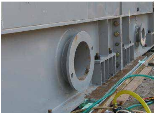
Figure 1. Saturating and draining the excessive water in the anchor holes of the turbine foundation prior to grouting.

Base plates, bolts, etc. must be clean and free of oil, grease and paint etc. Set and align equipment. If shims are to be removed after the grout has set, then lightly grease them for easy removal.