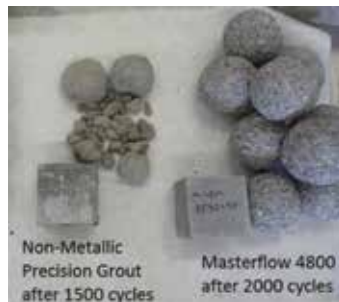
Figure 3. Grout samples after 1500 and 2000 cycles.