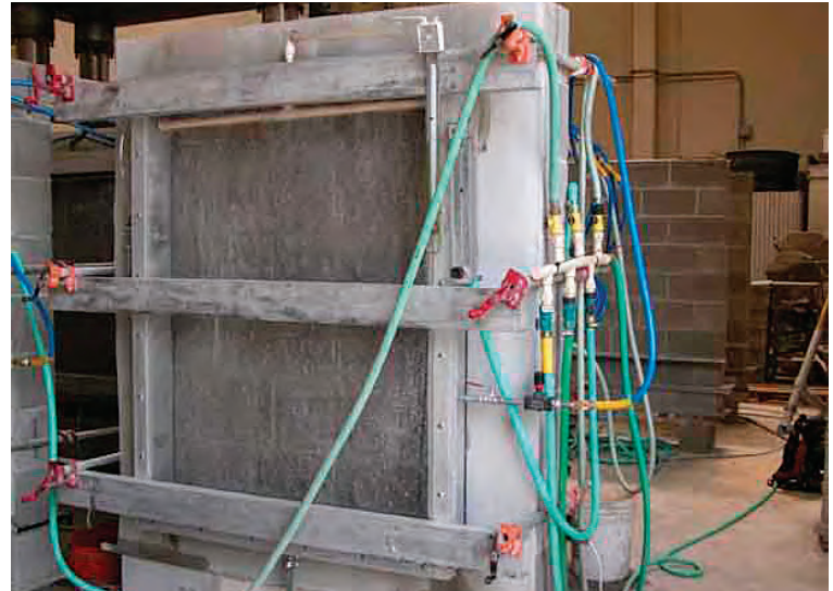
ASTM E 514 Testing of CMU wall

Masonry walls with and without BASF MasterPel admixtures were constructed according to ACI 530.1/ASCE 6/TMS 602 and tested according to ASTM E 514, Standard Test Method for Water Penetration and Leakage Through Masonry. The testing was conducted by the National Concrete Masonry Association and extended for 72 hours and rated according to the 1974 version of ASTM E 514.