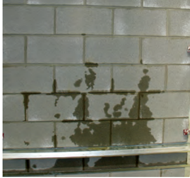
Project # 05-281 - Initial Testing Back of Reference Wall (no admixture)