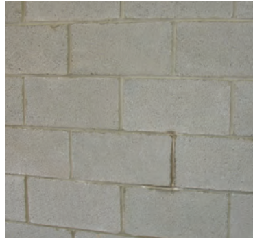
Project # 05-281 - After 72 Hours MasterPel 240-Treated Wall