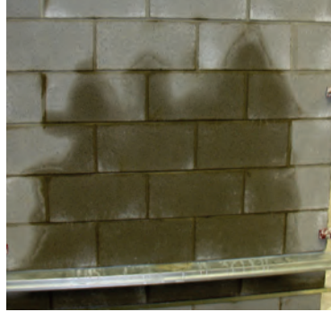
Project # 05-281 - After 72 Hours Back of Reference Wall (no admixture)

Individual CMUs: Several test methods are available to measure individual CMU water-repellency. These tests can verify and help ensure water-repellent performance before a concrete masonry wall is ever built.