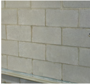
Project # 05-281 - Initial Testing MasterPel 240-Treated Wall