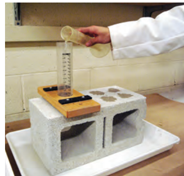
Low pressure permeation and surface puddle retention test

These standard and non-standard water-repellency test methods can be used to optimize mix designs, admixture dosages, and water-repellency characteristics for CMU production.