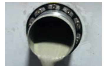
Bolted connection and grout overflow